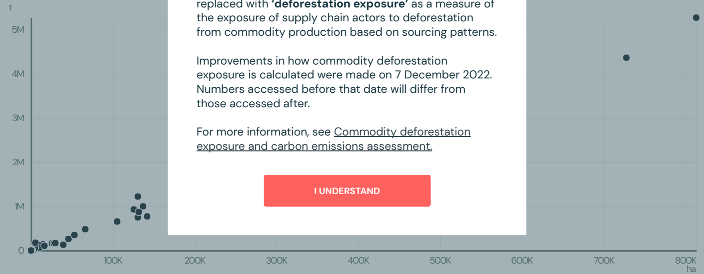
Comparing companies importin

KILEBA - LOGISTICA LDA was the 166th largest importer of corn from BRAZIL in 2017, accounting for 2 tons. This is a 72% decrease vs the previous year. As an importer, KILEBA - LOGISTICA LDA sources from 1 municipalities, or 0% of the corn production municipalities.