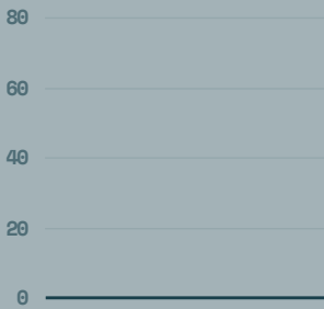
COFFEE IMPORTED IN 2016 (tonnes)